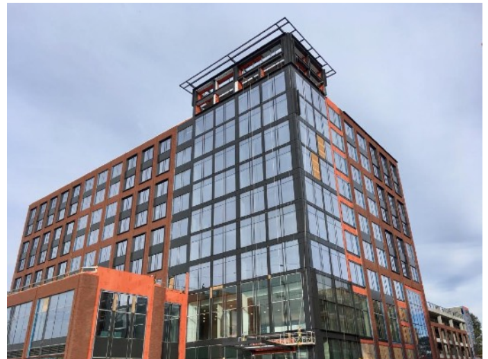
Above: LifeWay Christian Resources, Nashville, dedicated their new headquarters building on November 27.