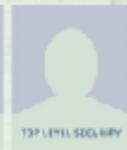
Melissa Missions Team