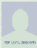
Berni Missions Team